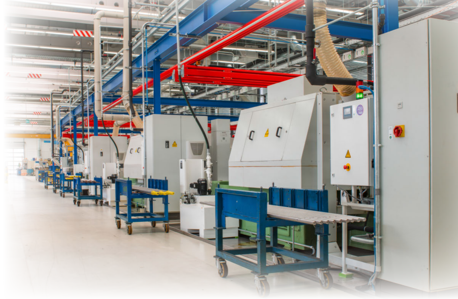
Our Thread Grinders have moved completely